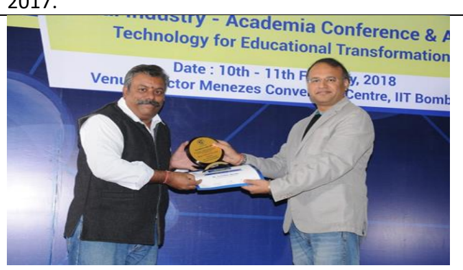
The Department has received "Best Accredited Student Branch Award" by Computer Society of India for the year 2018.