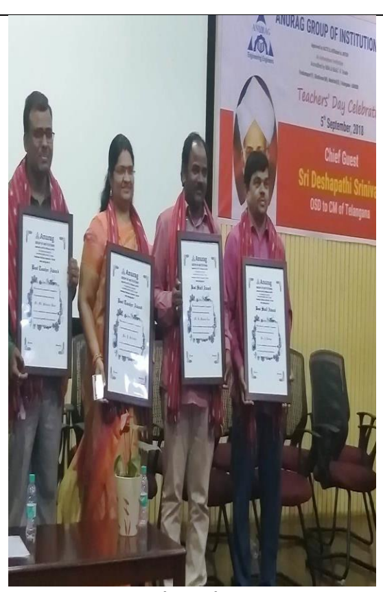
The best teacher(Male); Best teacher (Female); Best technical staff; and best non-teaching staff awardees for the year 2017-18