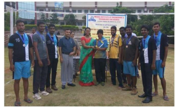
Faculty participated in inter-college volleyball tournament