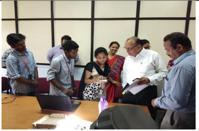
IV Year Students exhibiting their project during project Expo to experts conducted during June 2018.