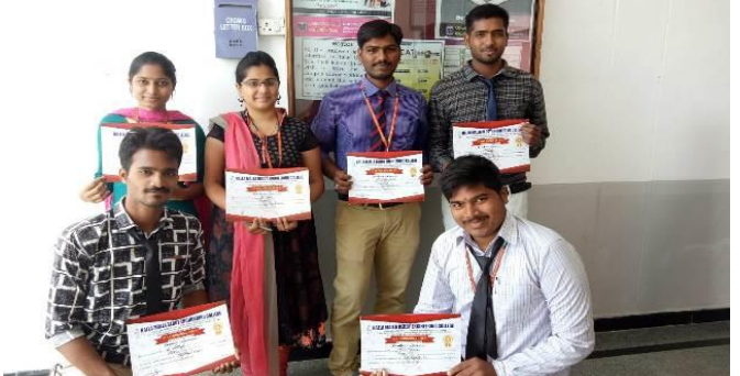
The students have participated in Nalla Malla Reddy Engineering College "Shodhana2K18" Management Meet in the Month of May 2018 & won various prizes.