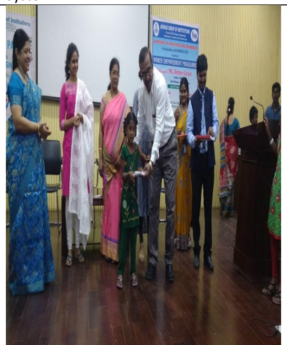
Save Paper Campaign