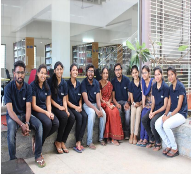
10 students were selected as facilitators by Scale India through IUCEE, Speed