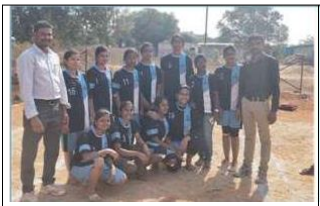
Kabaddi Women Runner Up at inter college tournament