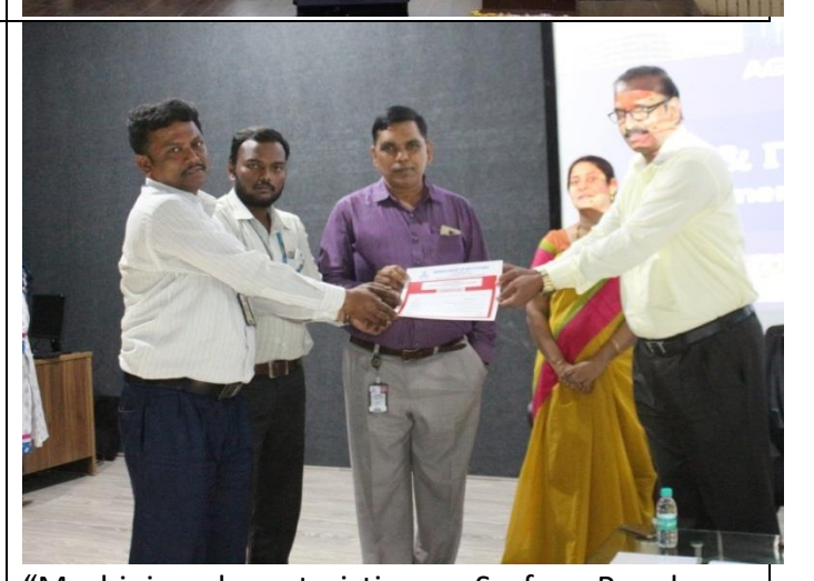
"Machining characteristics on Surface Roughness of (ZrO2) Reinforced in Al-7075" by 1. P. ChinnaSrinivasRao 2. T. Prasad was selected as Best paper in the First National Conference in AGI