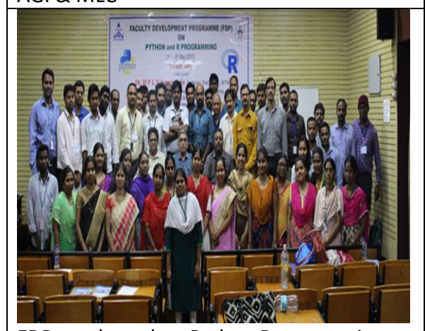
FDP conducted on Python Programming