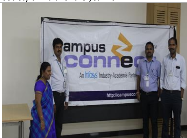
Inspire-Infosys Campus Connect Faculty Excellence Awards