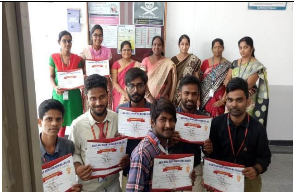
2017-19 batch students have participated in Nalla Malla Reddy Engineering College "Shodhana 2k18 "Management Meet in the month of May 2018 and won various prizes.