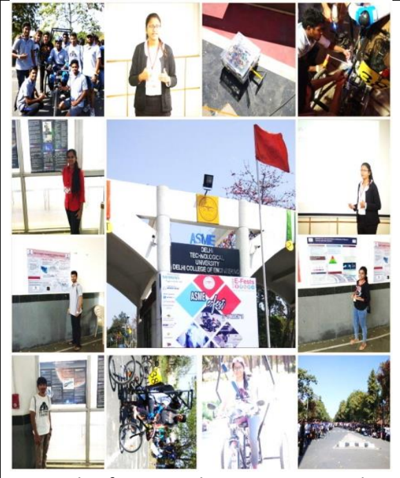
A Total of 28 students participated in "ASME ASIAN PACIFIC E-FEST – 2018" in Delhi Technological University ,New Delhi from March 11<sup>th</sup> to 20<sup>th</sup> 2018