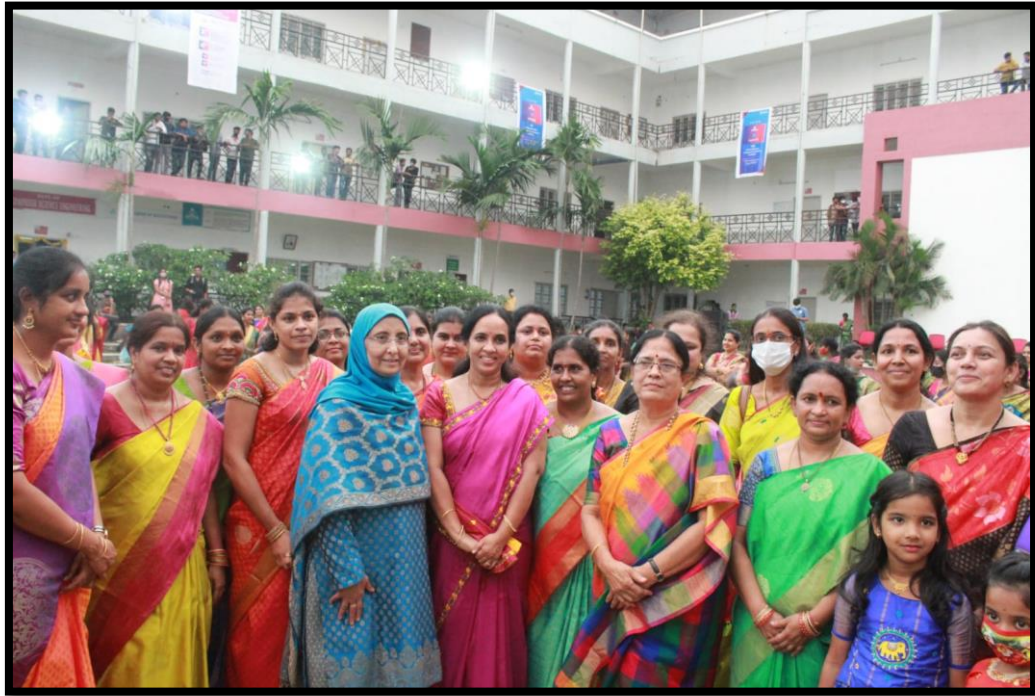
World Pharmacists Day-2021 Celebration at School of Pharmacy, Anurag University